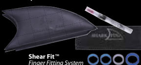
Shear Fit™ Finger Fitting System