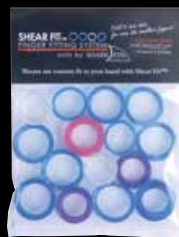
Shear Fit™ Finger Fitting System - 15 Inserts