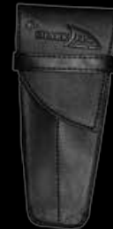
Black Leatherette Pouch Holds one shear