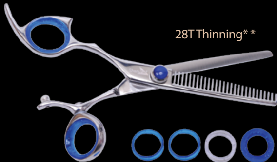
28T Thinning* *