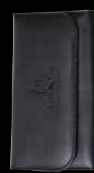
Tri-Fold Leatherette Pouch Holds two shears