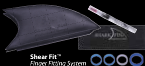
Shear Fit™ Finger Fitting System